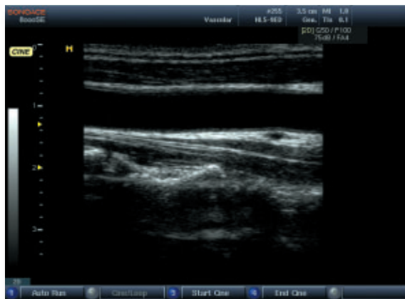
Common Carotid Artery in 2D