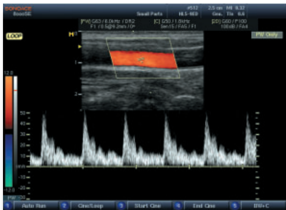
Common Carotid Artery in Doppler