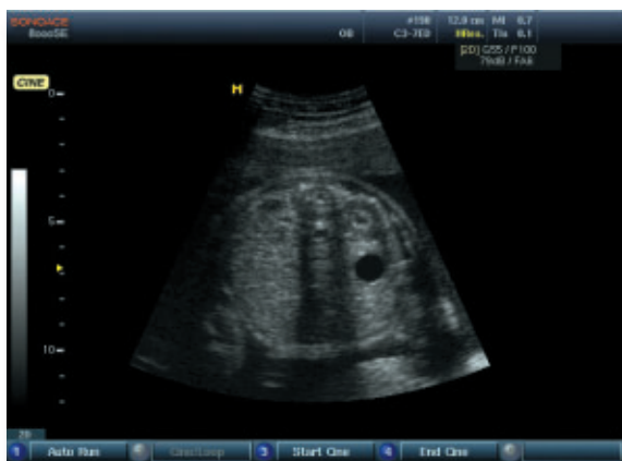
AC Section in 2D

The New Evolution in Introductory Color Ultrasound