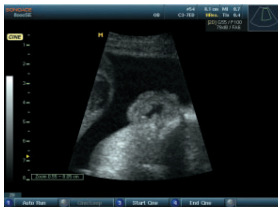
Fetal Ear in 2D