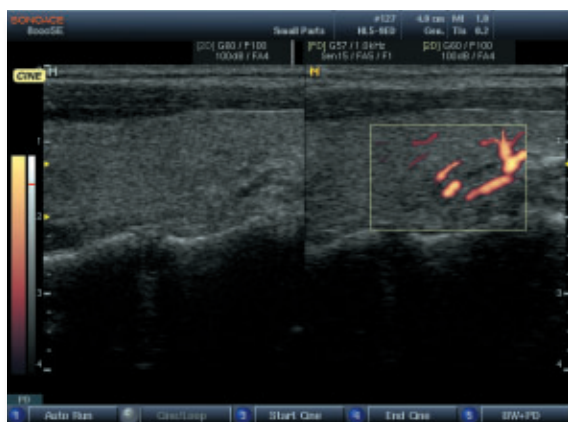
Thyroid in Power Doppler