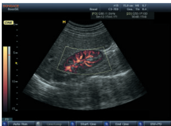
Kidney in Power Doppler